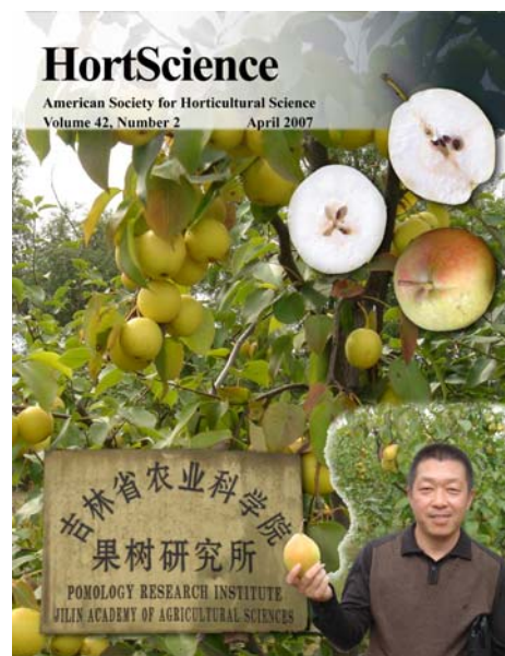
Journal Cover Story